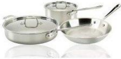
5-Piece Starter Kit